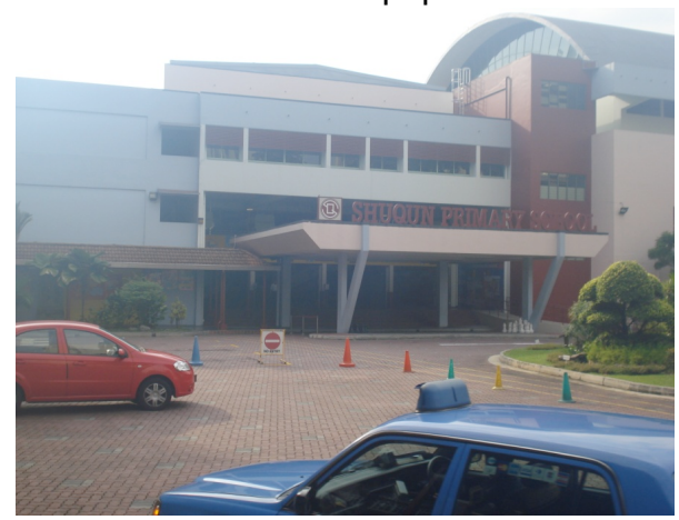
Rooms are large, ratios 1:30 in juniors and 1:40 in other rooms.